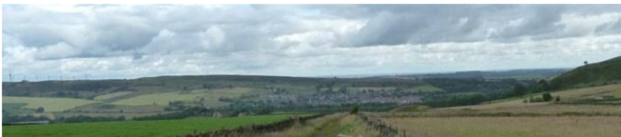
Millhouse Green (14)

Description - This is a long walk from Stocksbridge to the market town of Penistone. The first section follows the railway line used in the construction of Langsett Reservoir. We then climb across by Hartcliff Hill before dropping down to the TPT at Ecklands. The route then follows the trail through Thurlstone to Penistone and on past Oxspring before returning over Snowden Hill.