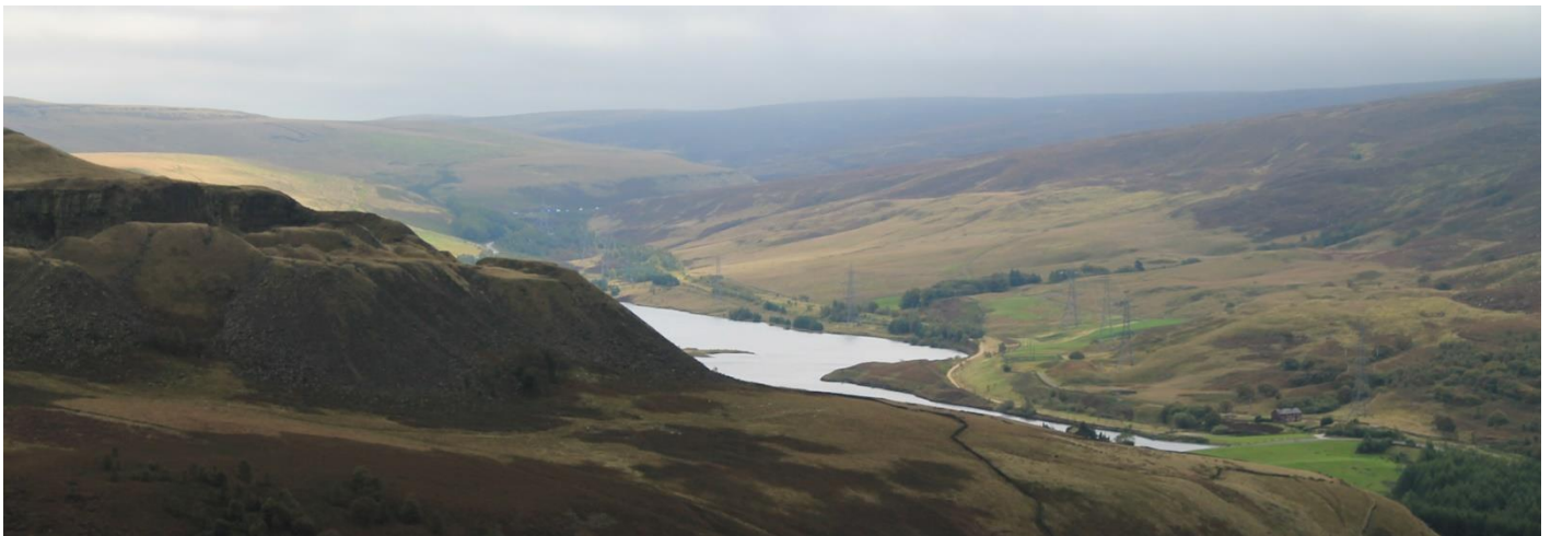
Woodhead Reservoir as seen from (5)

Starting from the car park, we head northwards ascending onto moors before looping back to cross the A628. We then follow the north side of two reservoirs before re-crossing the A628, back to our start. The early part of the walk involves both strenuous climbs and exposed moorland.