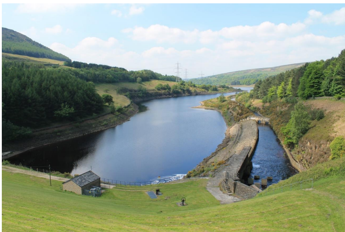
Rhodeswood Reservoir, looking West

The Manchester Corporation Waterworks Act 1848 allowed the construction of Torside and Rhodeswood Reservoirs, and an aqueduct to convey the water to the Arnfield reservoir where it would pass through the Mottram Tunnel to Godley. Rhodeswood Reservoir was constructed by John Frederick Bateman between 1849 and June 1855 as part of the Longendale chain to supply water from the River Etherow to the urban areas of Greater Manchester. Water is extracted to pass through the Mottram Tunnel to Godley for Manchester. During construction, landslips were a problem. Bateman consulted both Robert Stephenson, and Isambard Kingdom Brunel. Subsequently, pipes were sunk to draw off water from the underlying shale.