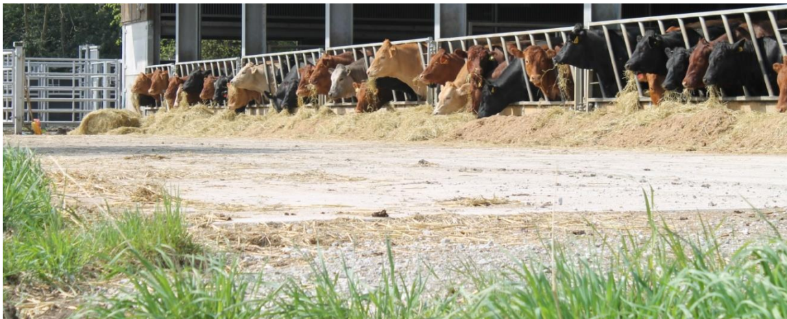
Cattle at Cannon Hall Open Farm (5)

Description – This varied circular walk takes you through woods, alongside streams, through a country park and across fields. There are extensive views and, in the late Spring, many opportunities to see bluebells.