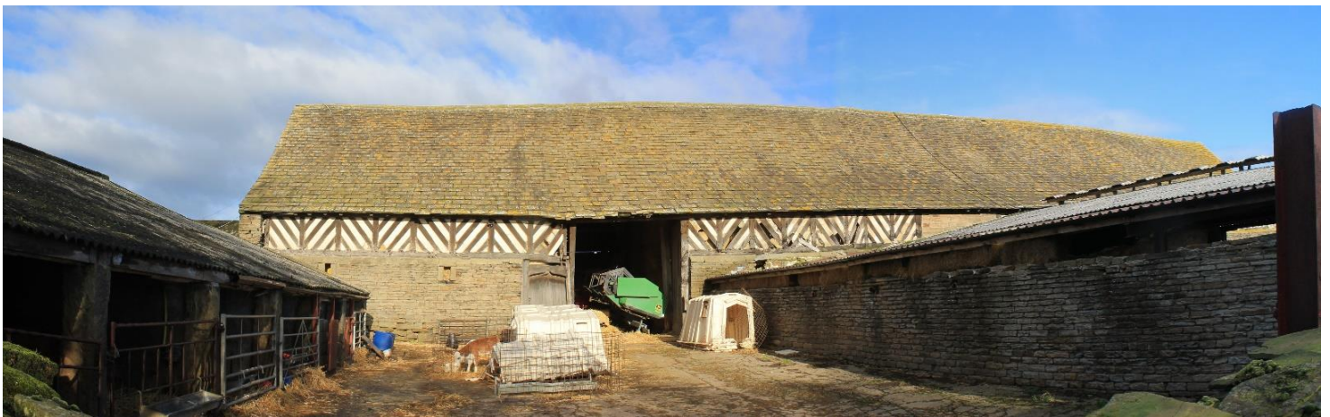
The C16 th .Tithe Barn at Gunthwaite Hall (9)

Description – This linear walk takes you from Denby Dale Railway Station to Penistone Station via Upper Denby, Gunthwaite Tithe Barn, Scout Dike Reservoir and Thurstone. We suggest that you start in Penistone and use the hourly train service (Northern Trains) to reach Denby Dale before returning on foot. The train journey lasts seven minutes.