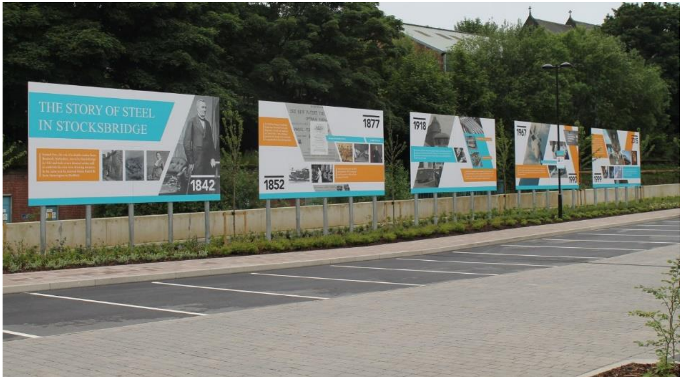
The Story of Steel in Stocksbridge