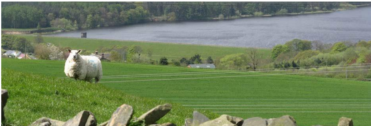
Underbank Reservoir seen from Hunshelf Bank (9)

An interesting walk full of contrast, from the slopes of Hunshelf Bank with panoramic views over the town and beyond, to the moors, to the industrial steel mills in the valley floor.