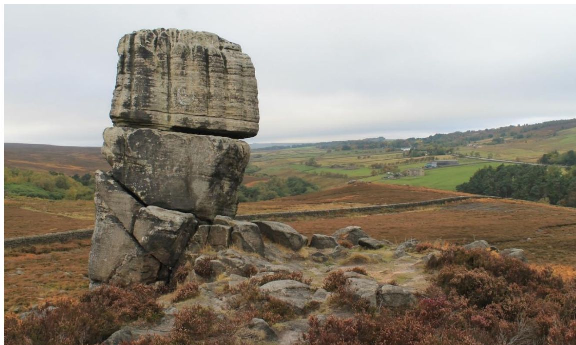
The Head Stone (12)

This circular walk starts at Rivelin Dams and takes you via Wyming Brook Nature Reserve to Redmires Reservoirs and then back again via the scenic route. This journey encompasses a varied mixture of stunning scenery, including fields, moorland, woodland and riverside paths.