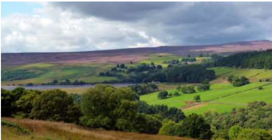
Looking across Strines reservoir

Description - Starting at Low Bradfield the walk climbs to Dale Dyke reservoir before dropping down in front of the dam and then going along the side of the reservoir for a distance. The route then climbs up and across Ughill moor. The route then drops down before looping back towards Ughill. There are good views across the Dark Peak section of the National Park. The route then goes down wooded valleys before arriving at Damflask reservoir and a back to Low Bradfield. There are a few short road sections.