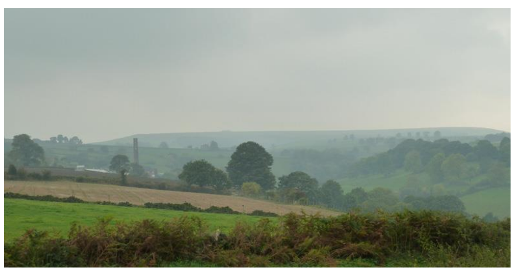
Looking along the Loxley Valley.

Description - A walk above and along the Loxley Valley on the western edge of Sheffield. The route takes in open countryside, passes through small villages and returns along the valley past with the derelict works that were originally established in the valley to make use of water power.