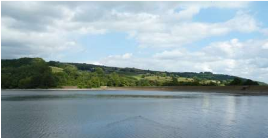
Looking across Agden reservoir