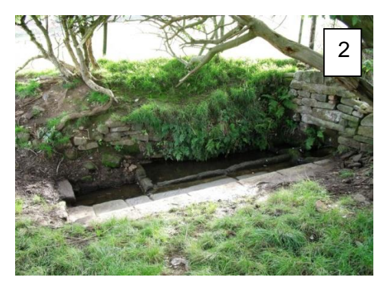
Figure 2 and Figure 3 (before and after restoration) and Information board

Go down the path for about 100m to reach the Tungate well and washing trough where there is a pleasant sitting area and information board. Some local people used to believe the spring water had medicinal properties and possibly collected and used it to cool those ill with fever. The troughs and area around them have been restored and planted using Lakeland Landscape Partnership funding.