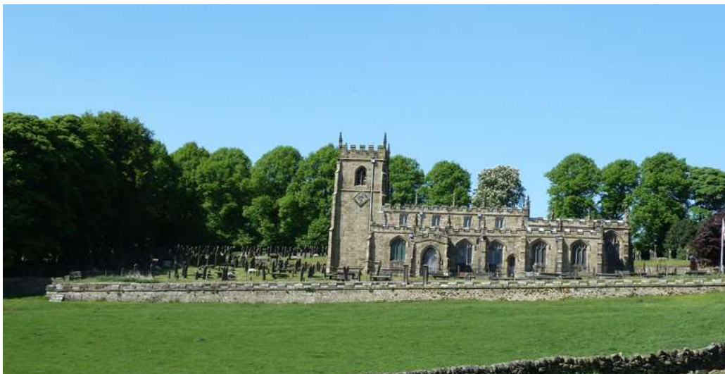
St Nicholas Church in High Bradfield.

Description - A walk above and along the Loxley Valley on the western edge of Sheffield. The route takes in open countryside, passes through small villages and returns along the valley past with the derelict works that were originally established in the valley to make use of water power.