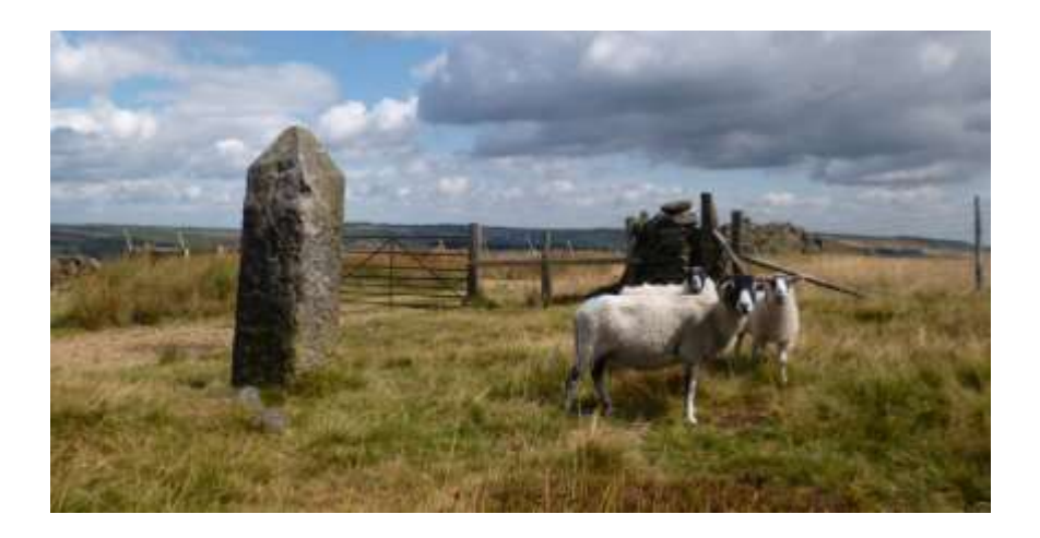
On Ughill Moor

Description - A circular walk with a combination of farm lanes around Dale Dike reservoir followed by a climb onto Ughill Moor, with open views across the Peak District National Park. The route has well defined paths and tracks, even across Ughill Moor. The descent back to the Strines dam is steep and can be boggy in wet weather.