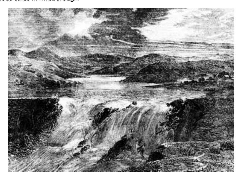
Breaching of Dale Dyke Dam