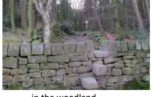
in the woodland.