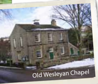
Old Wesleyan Chapel

Next on the right are the FILTER HOUSES , built in 1913 and extended in 1954,