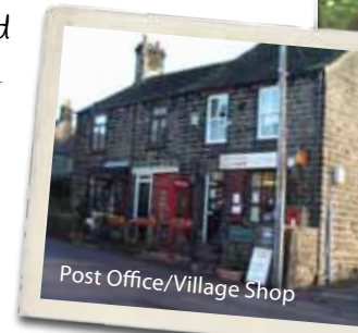
Post Office/Village Shop

Bear right keeping beside the field wall. The group of houses opposite are BURNSIDE COTTAGES , the earliest of which dates back to around 1625, (it is believed that this is where the first victim of the flood occurred when a two day old baby was washed from its mothers arms) whilst behind is THORN HOUSE , where the mill owner at the time of the flood resided. Moving further on, BURNSIDE HOUSE is the large house on the right, after which we come to WOODFALL LANE which leads to HIGH BRADFIELD . This piece of road is referred to locally as 'The Street' with the CAFE / POST OFFICE / VILLAGE SHOP on the right and the former CROSS INN on the left corner. The inn closed around 1980 and was converted into a private house.