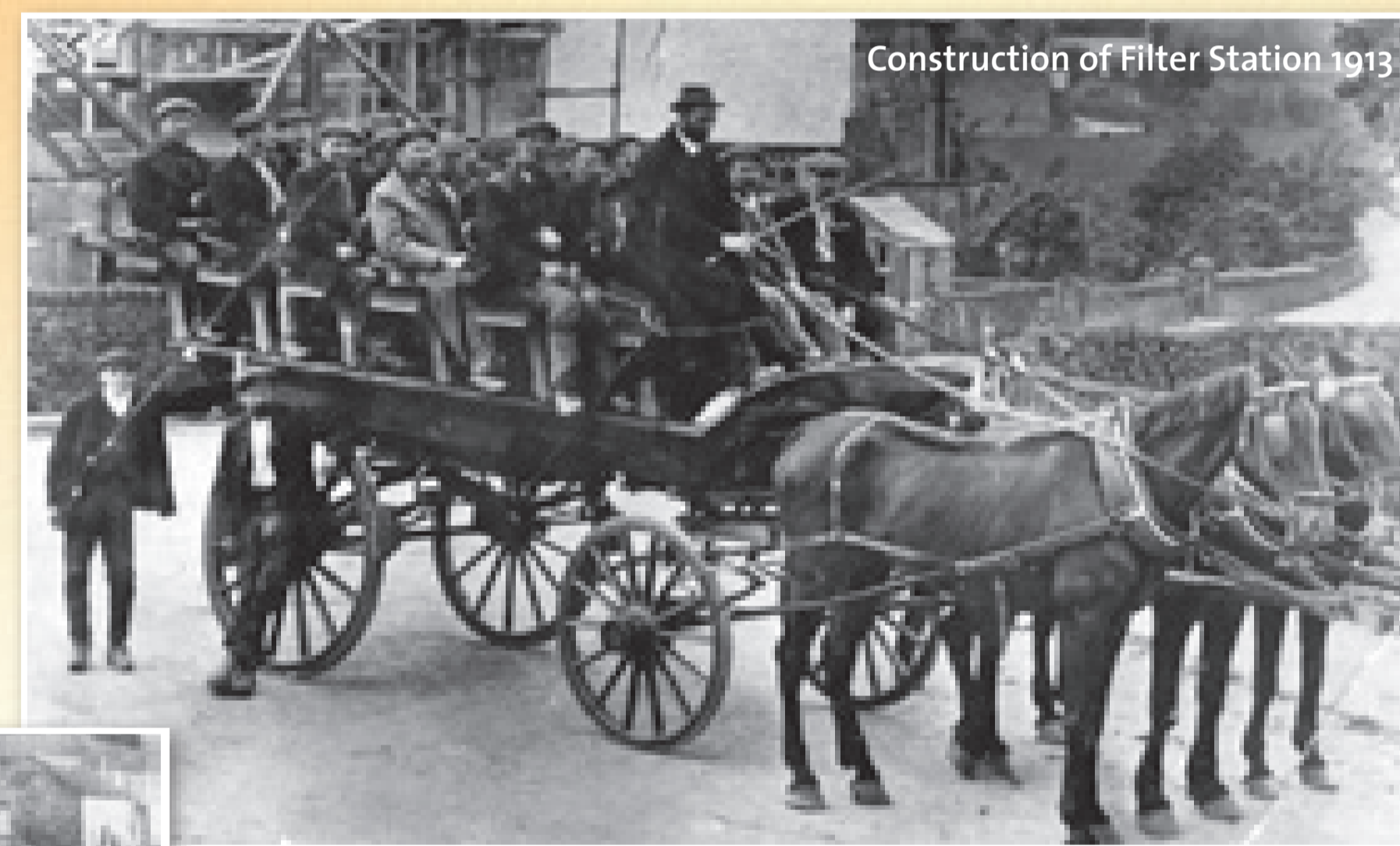
Construction of Filter Station 1913

The mill was rebuilt, but burned down in 1940. The remains of the mill pond can still be seen by the bridge behind the Smithy Garage.